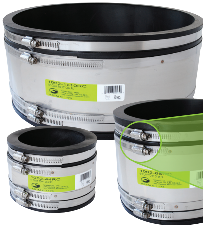
1000 RC Series 6000 RC Series 301 series stainless steel worm gear clamps