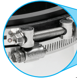
5000 RC Series 316 series stainless steel nut & bolt clamps